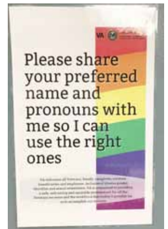
Posted next to the Pharmacy window at the VA

I was struck yesterday by the word “feminism” as I was reading a story about how much Trump “hates women.” What does that word even mean, I wondered out loud? What does being a feminist have to do with being feminine? Why is it that the one thing that so many feminists lack is femininity?