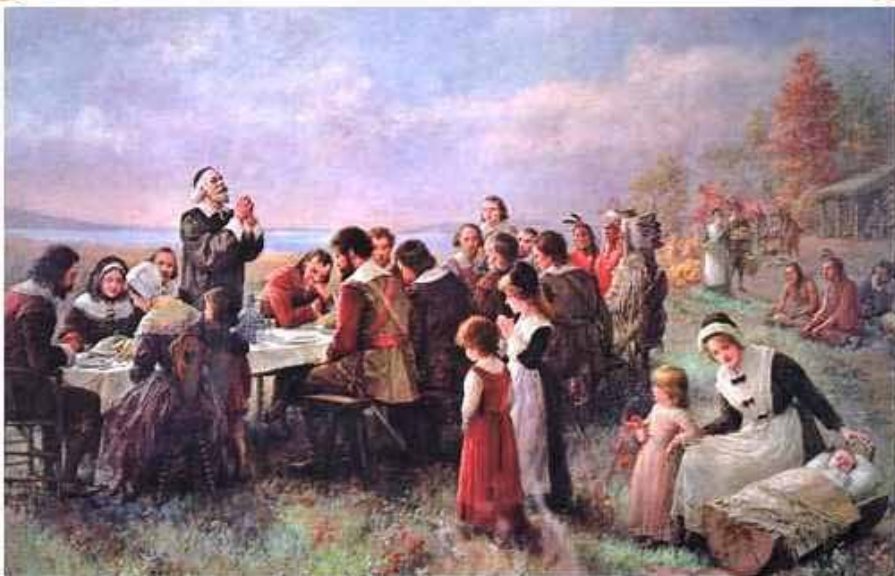
"The First Thanksgiving at Plymouth" By Jennie A. Brownscombe (1850-1936) Painted 1914

https://www.biblicalexaminer.org/JudaismOpen.html