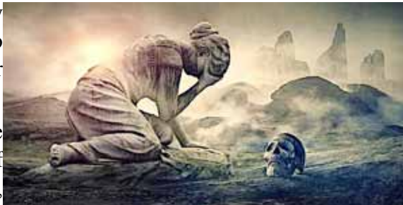
Weap and pray for America

TikTok's in-app browser uses JavaScript code that can see everything you type. There are a few instances where other apps also do it, but none are to this extent. As Krause explains, this kind of browser tracking is a deliberate action.