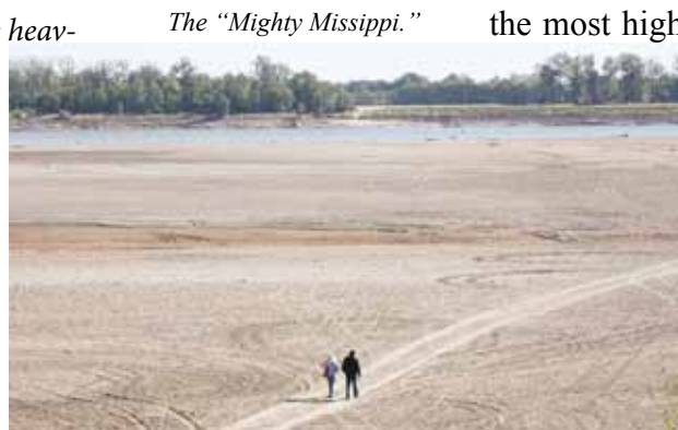
The “Mighty Mississippi.”